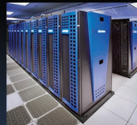
SDSC'S GORDON SUPERCOMPUTER.

THE DATA AVAILABLE TO ASTRONOMERS IS GROWING EXPONENTIALLY. LARGE NEW INSTRUMENTS AND NEW SURVEYS ARE GENERATING EVER LARGER DATA SETS, WHICH ARE ALL PUBLICLY AVAILABLE. SUPERCOMPUTER SIMULATIONS ARE USED BY AN INCREASINGLY WIDER COMMUNITY OF ASTRONOMERS. MANY NEW OBSERVATIONS ARE COMPARED TO AND INTERPRETED THROUGH THE LATEST SIMULATIONS. THE VIRTUAL ASTRONOMICAL OBSERVATORY IS CREATING A SET OF DATA-ORIENTED SERVICES AVAILABLE TO EVERYONE. IN THIS WORLD, IT IS INCREASINGLY IMPORTANT TO KNOW HOW TO DEAL WITH THIS DATA AVALANCHE EFFECTIVELY, AND PERFORM THE DATA ANALYSIS EFFICIENTLY. THE SUMMER SCHOOL WILL ADDRESS THIS ANALYSIS CHALLENGE. THE TOPICS OF THE LECTURES WILL INCLUDE HOW TO BRING OBSERVATIONS AND SIMULATIONS TO A COMMON FRAMEWORK, HOW TO QUERY LARGEDATABASES, HOW TO DO NEW TYPES OF ON-LINE ANALYSES AND OVERALL, HOW TO DEAL WITH THE LARGE DATA CHALLENGE. THE SCHOOL WILL BE HOSTED AT THE SAN DIEGO SUPERCOMPUTER CENTER, WHOSE DATA-INTENSIVE COMPUTING FACILITIES, INCLUDING THE NEW GORDON SUPERCOMPUTER WITH A THIRD OF A PETABYTE OF FLASH STORAGE, ARE AMONG THE BEST IN THE WORLD. SPECIAL ACCESS TO THESE RESOURCES WILL BE PROVIDED BY SDSC.